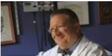
Benjamin Warf Services and Care