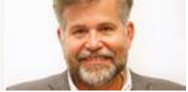
Cato Lie Treasurer Norway