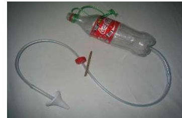
Complete set with reservoir